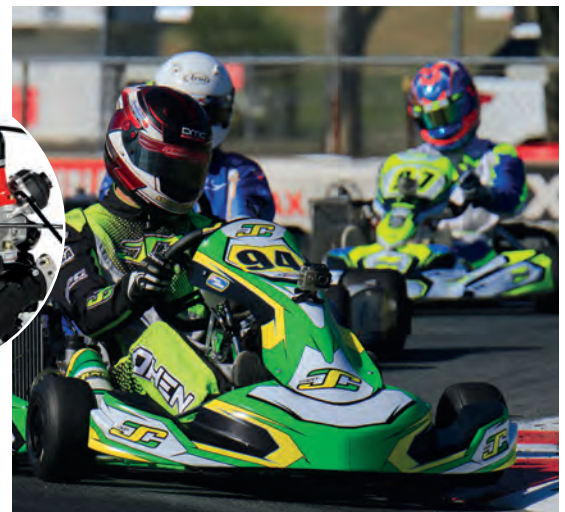
ROTAX PRO TOUR