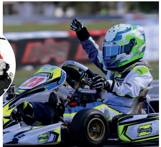
ROTAX PRO TOUR