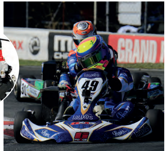
ROTAX PRO TOUR