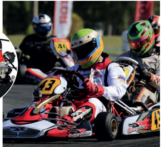
ROTAX PRO TOUR